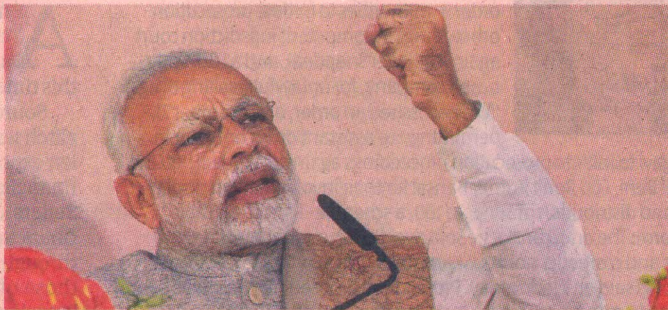
Prime Minister Narendra Modi said he has asked the GST Council to bring houses meant for the middle class in the 5% GST slab